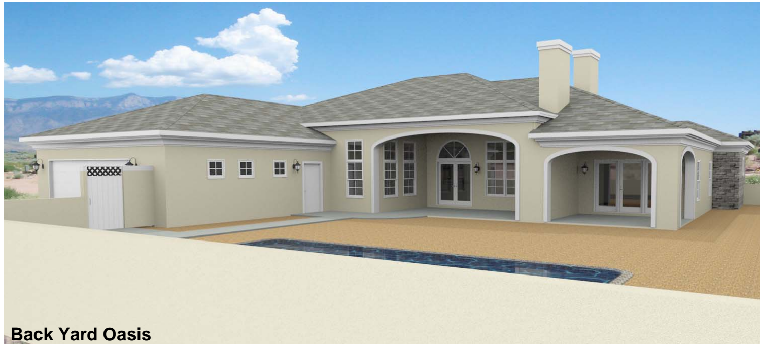
Back Yard Oasis

All square footage is approximate. Renderings are conceptions and may vary slightly from actual home. Windows may vary with exterior design. Homes may be built reverse of plans shown, depending on site conditions. Minor architectural changes may be made at the option of the builder. Model homes may feature upgraded options not included in base price. Please consult with your sales rep for any questions.