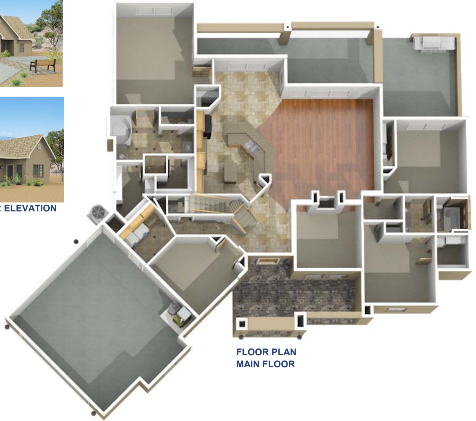
FLOOR PLAN MAIN FLOOR

All square footage is approximate. Renderings are conceptions and may vary slightly from actual home. Windows may vary with exterior design. Homes may be built reverse of plans shown, depending on site conditions. Minor architectural changes may be made at the option of the builder. Model homes may feature upgraded options not included in base price. Please consult with your sales rep for any questions.